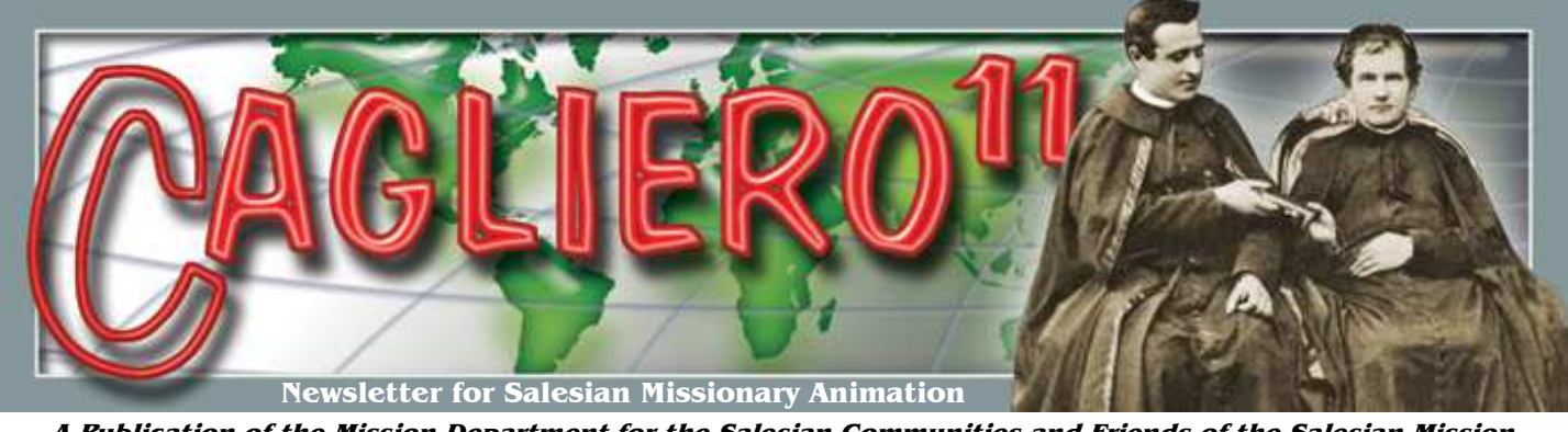
A Publication of the Mission Department for the Salesian Communities and Friends of the Salesian Mission

ear confreres and friends of the Salesian missions!